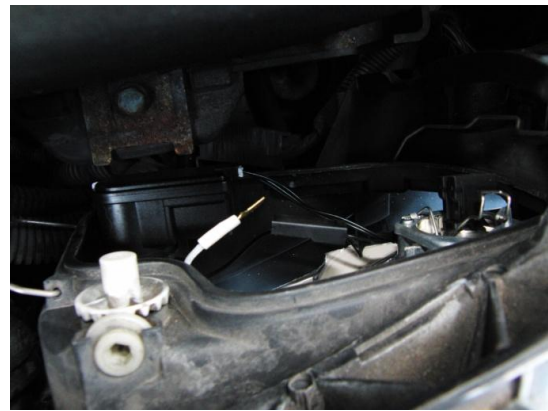
HIGH BEAM SUPPLY DISCONNECTED