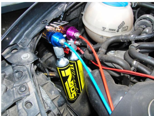
SFBK ZIP TIED TO INNER WING LIP