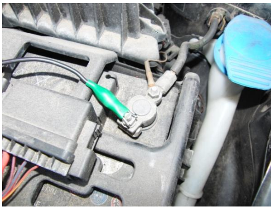
GROUND CLIPPED TO BATTERY NEG POST