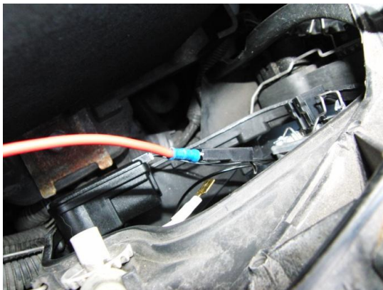
SFBK POWER LEAD CONNECTED

The system is triggered by the activation of the momentary main beam (flash) headlamp switch and will stay activated for as long as the switch is held in the operated position, as soon as the switch is released the system will instantly shut off. (The same applies to your own momentary switch should you choose this option)