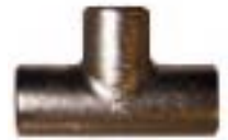
Plated brass 3 way connectors