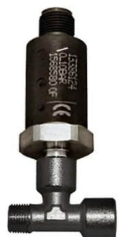
Internal face seal

The same 4 way block can be used when running twin bottles to link them together and provide a common port for the transducer as shown below.