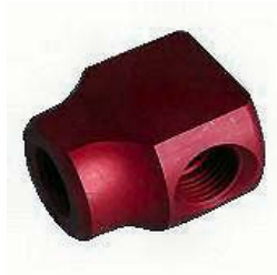
Billet alloy 3 way connector