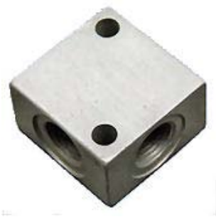
Billet alloy 4 way block